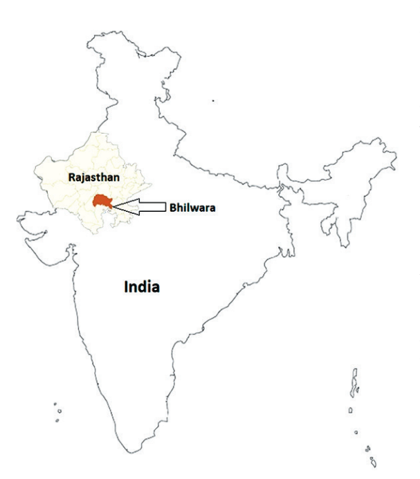
Photo: A map of India Map of India showing Rajasthan and Bhilwara District (source: https://d-maps.com/carte.php?num_ car=24853&lang=en).

Bhilwara had a surge of COVID-19 outbreak and the virus started spreading at the local and community level. The number of new coronavirus cases increases exponentially peaking at 26 new infections on March 30. But the new case has dropped significantly and the district has reported only 10 new cases in the last 4 weeks ending on 4 May 2020 [6], and 32 out of 37 patients have been recovered. Bhilwara was able to successfully flatten the curve on COVID-19 in only 20 days with its containment strategy executed with clockwork precision, immaculate coordination, and extreme efficiency.