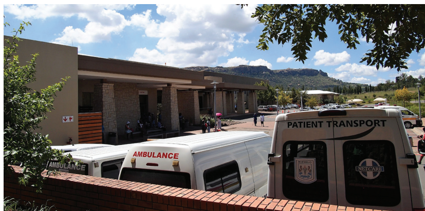
Photo: The Queen 'Mamohato Memorial Hospital in Lesotho. Experience with this hospital highlighted problems of investing in hospital care without a strong primary health care system. More at: A dangerous diversion: Will the IFC's flagship health PPP bankrupt Lesotho's Ministry of Health? OXFAM Briefing Note , 7 April 2014.

The four indicators classified as inputs fall across the categories of financing, resource management, and governance and organization. With regards to financing, Indicator B.2, total ODA for health, can have an impact on health systems outputs, but there is no clear linkage between this indicator and any specific outputs or impacts tracked by SDG 3. It is not even clear what improvement on this indicator would look like. While an increase in ODA may signify increasing expenditure on health, it does not take into account government and out-of-pocket spending on health, and it may also cause or exacerbate issues with donor dependency in low- and middle-income countries (LMICs). Further, given the variation in