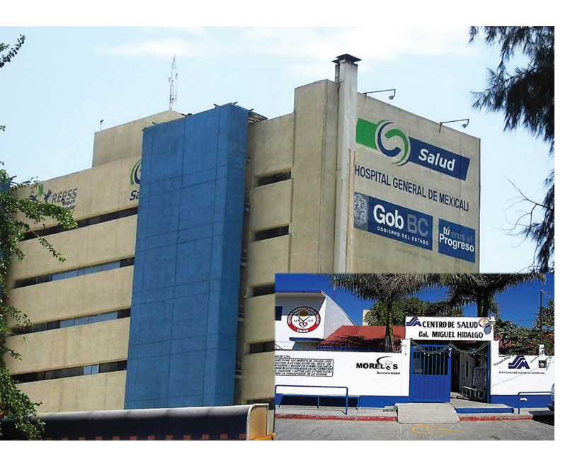
Photo: The difference infrastructure for curative care vs. primary care in Mexico.