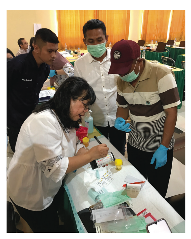
Photo: INA-RESPOND Laboratory Director conducting training at local health centers in Indonesia prior to the COVID-19 pandemic.

A significant proportion of Indonesia's clinical research is conducted by the Indonesia Research Partnership on Infectious Disease (INA-RESPOND) network, a collaborative partnership between NIAID, the Indonesia National Institute of Health Research and Development (NIHRD), and 19 large hospitals and medical facilities across 8 major islands of the archipelago. The network was formed in 2010 in response to