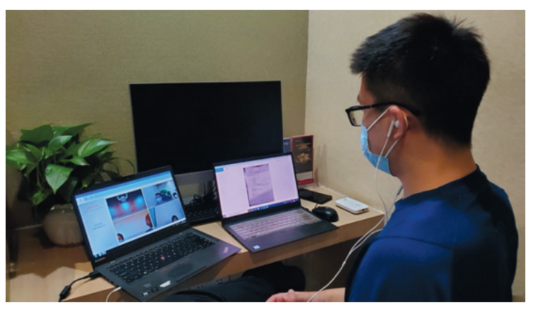
Photo: A lawyer is preparing for a remote court hearing on September 11, 2020.

First, the evidence the judge sees at the court is what has been processed electronically. This sort of evidence is not equivalent to the original evidence. Thus, remote court hearing reduces the possibility of the judge hav-