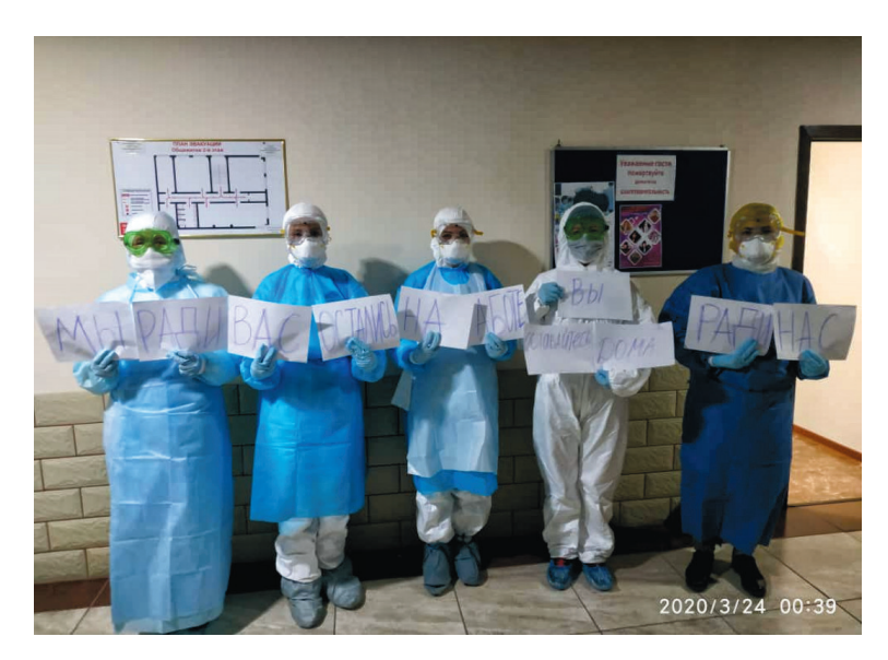
Photo: Health workers on the frontline of the fight against the COVID-19 pandemic in Kant town, Kyrgyzstan, saying "We stay at work for you, you stay home for us". (Owned by one of the co-authors, used with permission).

The Kyrgyz government lifted majority of quarantine restrictions after June 1, 2020. All business activities such as production and sales, consumer services, tourism and recreational activities were resumed [5]. At once, the number of incident cases of COVID 19 began increasing dramatically and by the end of the June 2020, the number of daily incident cases was almost 3 times higher compared to the start of the month [4]. Despite of all preparedness measures healthcare facilities started to experience difficulties with the increase of new cases prompting the Ministry of Health to develop an action algorithm, which included guidelines wherein individ-